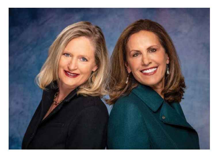
Serving Albuquerque and Santa Fe