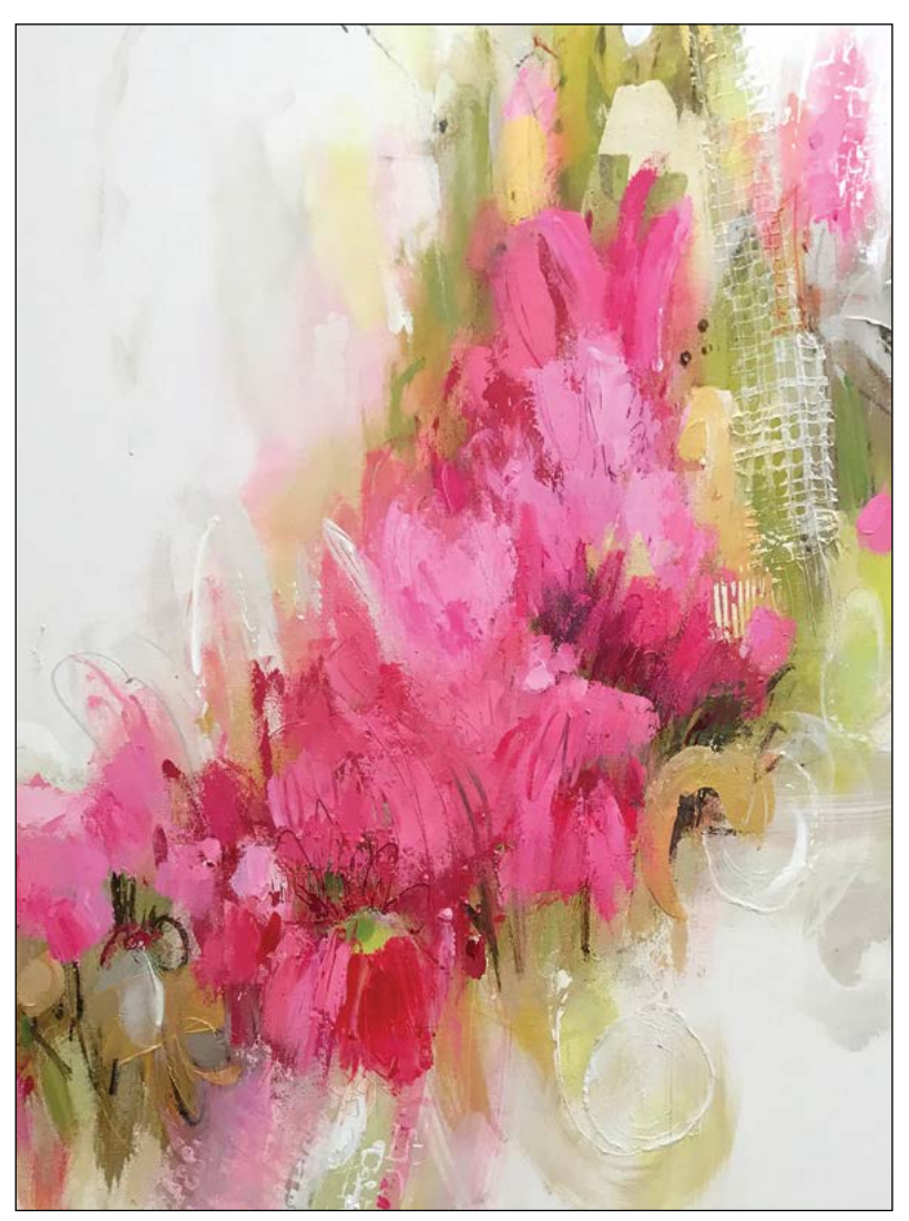
Peppermint Twist, by Janet Bothne (see page 4)